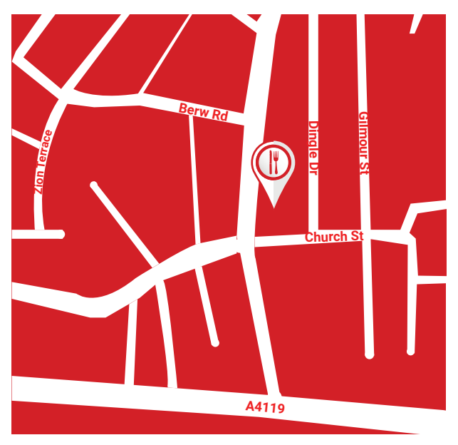
'Find us at 14 llwynypia road, tonypandy, CF40 2EL. You can also order for delivery online at www.contis.net